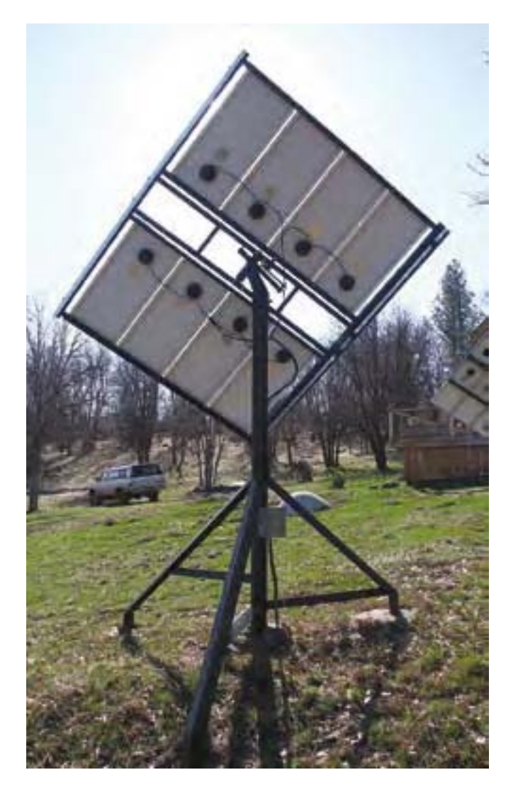
No motors or sensitive electronics on the back of the Zomeworks trackers—simplicity is reliability.

concrete base—don't skimp on the concrete! Follow the manufacturer's recommendations for mounting, and then add a bit more concrete to make sure that your tracker stays in the ground.