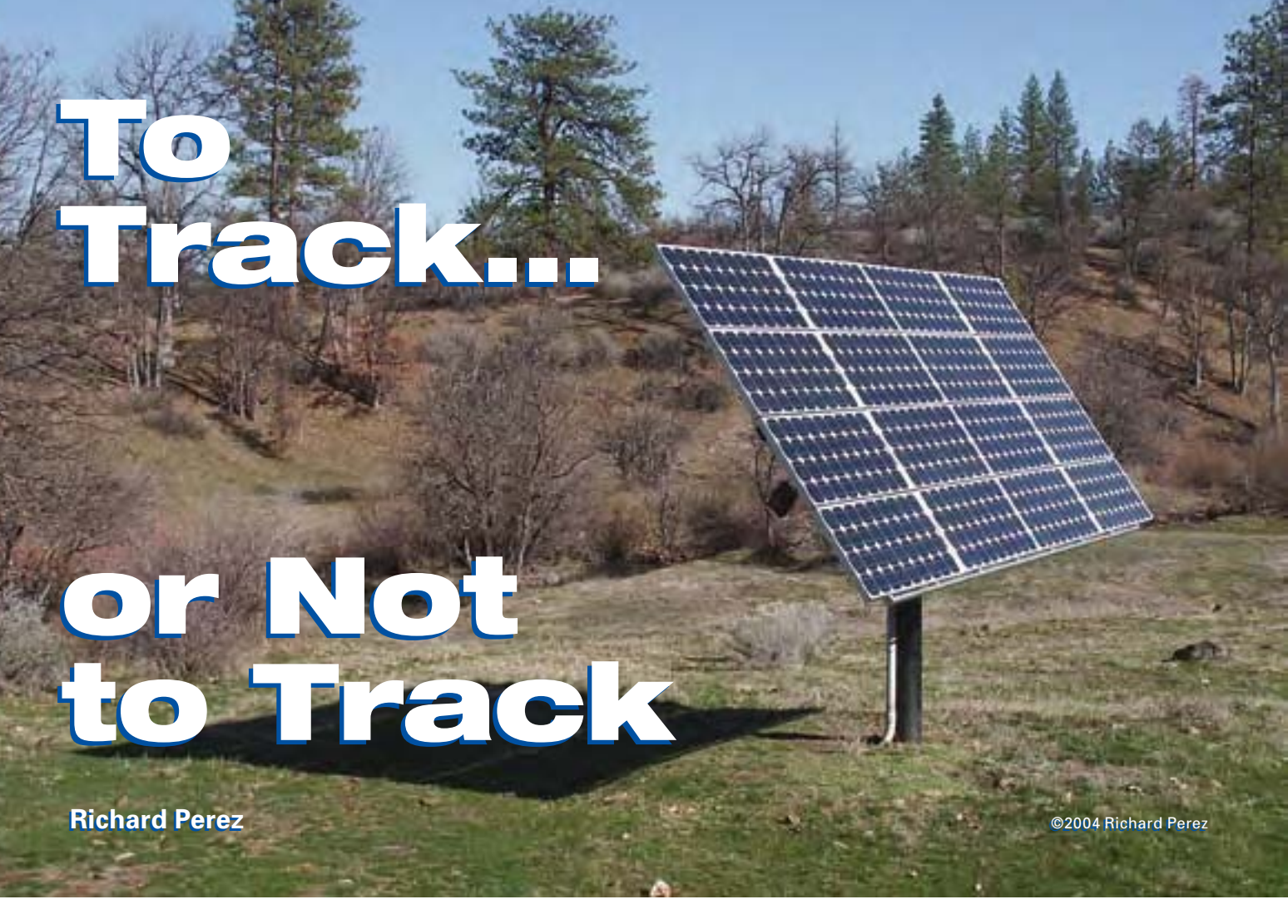
A 1,360 watt PV array on a Wattsun dual-axis tracker follows the sun all day, like a big silicon flower, maximizing solar output.

Trackers are PV mounting racks that follow the sun. PVs generate more electricity when they are directly facing the sun, but the sun is constantly moving across our sky. In the morning, it's low on the eastern horizon, and at sunset, it's low on the western horizon. At noon, the sun stands high in the sky. This apparent solar motion is due to the earth's rotation. Trackers maximize energy production by keeping the PV modules perpendicular to the incoming sunlight. How much more energy do you get? Well, this depends on the site and the type of tracker—from 25 to 40 percent more energy annually over a static mounted array.