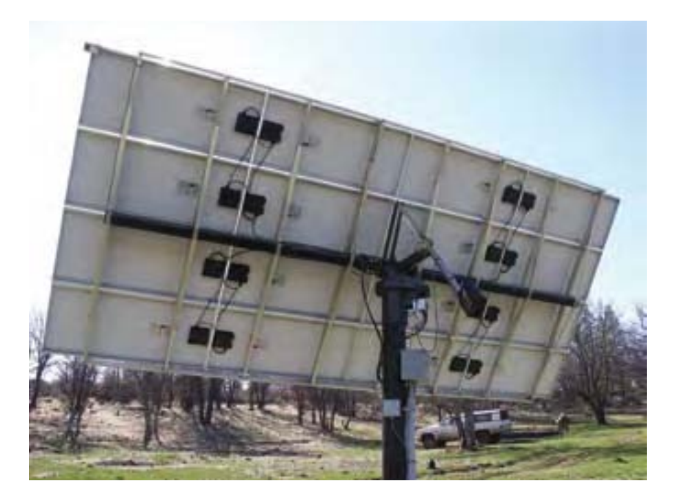
Precision—this large Wattsun tracker moves east to west with a top-of-pole gear; north-south adjustment is powered by a screw-drive actuator arm.

A third potential advantage of this type of tracker is shipping and installation. Since the tracker doesn't have to be assembled at the factory, it can be shipped in a number of boxes, reducing shipping expense and handling difficulties. The tracker can be assembled piece by piece on its mount; this is far easier than trying to hoist a heavy preassembled tracker onto its mounting pole.